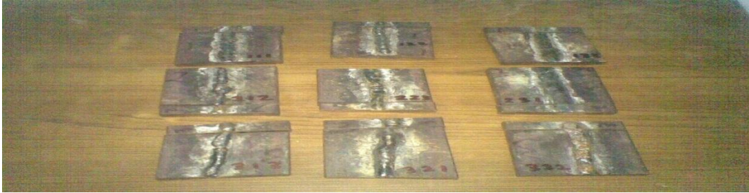
Fig.2. Hard-faced mild steel plate

A well formulated paste coating of ferro boron and sodium silicate was deposited on mild steel plate. The paste was applied with the help of paint brush on the base plate. Three important parameters ferroboration content, welding current and average welding speed were selected on the experimental work. Paste was applied on 9 different plates with three different ferro boron content such as 4, 8 and 12 \text{mg}/\text{mm}^2 , three different welding current 90,120 and 150 Ampere and three different average welding speed 45, 90 and 135 \text{mm}/\text{min} according to the combination selected from the orthogonal array.