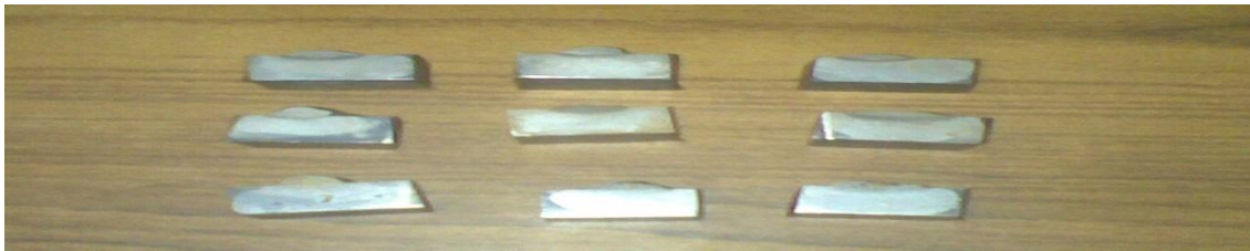
Fig.3. Sample for microhardness testing

The micro hardness test was carried out by polishing the cross-sectioned samples with emery papers up to grade 2000. For micro-hardness testing the specimens were prepared using standard procedure like belt grinding, polishing using successively fine grades of emery up to 2000 grit size. This was helpful in removing coarse and fine oxide layer as well as scratches on the surface that were to be metal graphically analyzed. Micro-hardness tester was used to measure micro-hardness at various zones of interest in different weldments. A load of 10 kgf and a dwell time of 20 seconds were used for these studies.