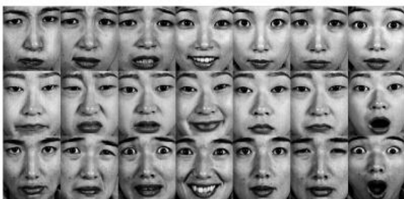
Fig3 : The sample iamges of the JAFFE database that have been excluded the non-face area

Which posed by 10 Japanese female models, which posed 3 or 4 samples of each of the six basic facial expressions and a neutral face. Some images in JAFFE were showed in figure. For simplicity, we select 3 instance images of per model at each expression (110 images in all) for our experiments.