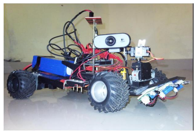
Fig. 4. Prototype command controlled unmanned ground vehicle (UGV)

advancement such as 3G services to provide ease of access and portability to our UGV. Other new technologies like Zigbee and Arduino have been implemented. The working of the UGV was demonstrated at the RGIT workshop, Bangalore (in June 2011) and successfully passed the test.