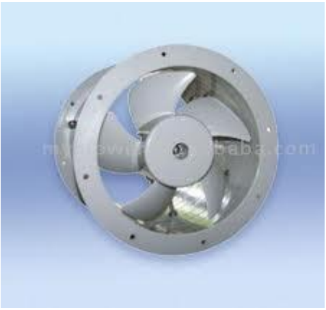
Fig.3 Axial Blower

The axial blower is an single phase AC blower with axial entry of air and the radial outlet. The speed of the blower and thereby the discharge can be varied using an electronic speed regulator.