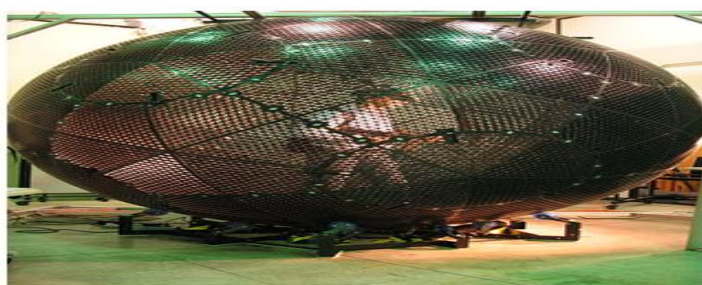
Figure 4: Front view of a virtual sphere