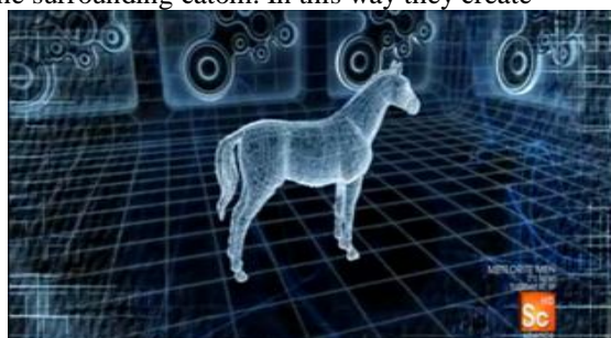
Figure 3: Applications of the programmable matter and claytronics

A group of tiny modular robots that can communicate with each other and can change their shape, size and color according to the surrounding catom. In this way they create