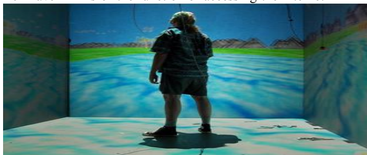
Figure 1. Front view of the cave virtual automatic environment

be instead of using macro screens controlled by equal size computers we can think of something really small. Technology already allows us to think of the contact lenses which have LED's or the function of accessing the internet