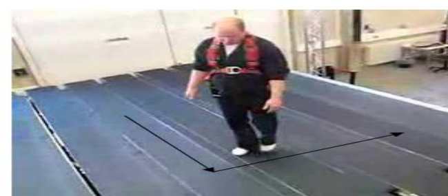
Figure 5: A cyber-walk Omni- directional treadmill