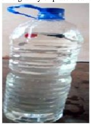
Figure 2. Buoyancy force was upward pushed the wood and plastic in water bottle.

We have studied buoyancy force to make developed a simple, low cost experiment to investigate the buoyancy force relationship between with specific gravity of body. We have considered the plastic ball (density of plastic ball 0.82g/cc, mass of plastic ball is 6 gram, volume of ball is 7.3cc). In experiment we are taking plastic ball and glass water. Next, we slightly press down the plastic ball in water by using external instrument, ball will reached on below surface. Immediately, we removed the external instrument. We have seen the plastic ball is going the upward on water at high force to reach on water. It rest to floating on water. May we knew that density of plastic ball is lower than density of water. Specific gravity is less. That's buoyancy force is highly upward pushed on water. In this simple experiment to make understand as buoyancy force is reciprocal the specific gravity of plastic ball.