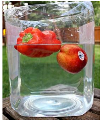
Figure 3, Buoyancy force was upward pushed the capsicum and apple body in glass.

We considered the capsicum and apple for conducting experiment. Now, we filled water in glass tube, saliently we took two bodies. These are dropped on glass tube. We slightly press down the apple and capsicum in water by using external instrument. These are go down the below surface at rest on down. Immediately we removed the external instrument. We have seen the apple and capsicumare going the upward directions. We have seeing that capsicum is going the high forcibly to reach on water. But apple is low forcibly or slow motion in glass. May we know that law of buoyancy force, as specific gravity of capsicum is low or lesser than specific gravity of apple. That was buoyancy force is pressed the high forcibly to capsicum. Then it's going the high