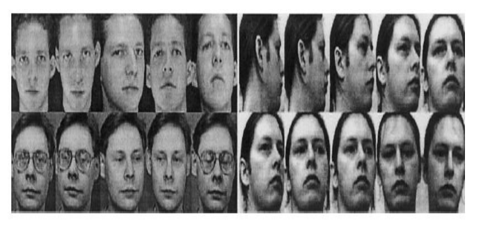
Fig. 2. Some sample images of three persons randomly chosen from the two databases. (Left): ORL. (Rright): UMIST.

databases. It is qualified to specify here that both test setups present SSS conditions subsequent to the number of preparing tests are in both cases much littler than the dimensionality of the information space. Additionally, we do have watched some allotment cases, where zero eigenvalues happened in as talked about in Section II-B. In these cases, conversely with the disappointment of D-LDA [6], DF-LDA was still ready to perform well