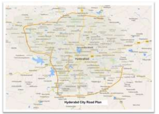
Hyderabad Road Plan

In this identification of pavement stretch in HYDERABAD was done by conducting field trips in Hyderabad and Cyberabad regions. Field Trips means direct on-fields observations to find the distress problems in each place. For this survey the following data was utilized: