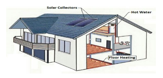
Fig 4. Scheme of a common grid connected roof integrated PV installation

.The inverter is used to convert the DC to AC .The AC output from the solar installation is wired back to the main consumer unit The consumer unit is connected to the electricity grid via an export meter. Such an installation is termed "grid-tied" because the electricity supply for the building is met by a combination of solar energy and grid electricity [1] [4].