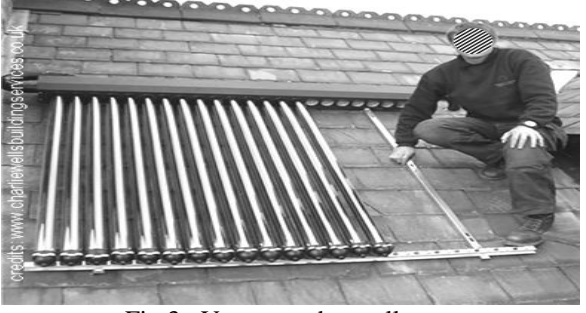
Fig 3. Vacuum tubes collector