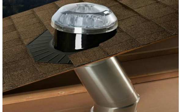
Fig 5. Solar optical system on the roof

Recently, energy and environmental concerns have made day lighting a rediscovered aspect of building lighting design. Day lighting is often integrated into a building as an architectural statement and for energy savings. The idea of piping light from a remote source to an interior space for illumination purpose appeared about 120 years ago light pipe is now being adopted and applied world widely for both artificial and natural day lighting purposes. With the increasing use of solar light pipes, more attention is being paid to their development, especially to the day lighting performance evaluation of the device.