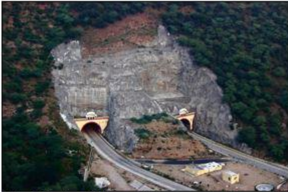
Fig 3. National Highway 11 connecting Jaipur and Agra opened in 2013

As indicated by 2009 gauges by Goldman Sachs, India should contribute US$1.7 trillion on foundation projects before 2020 to meet its monetary needs, a piece of which would be in redesigning India's street network.[10] The Government of India is endeavoring to advance outside interest in street projects.[10][11][12] Foreign investment in Indian street arrange construction has pulled in 45 international contractual workers and 40 configuration/designing experts, with Malaysia, South Korea, United Kingdom and United States being the biggest players.[13].