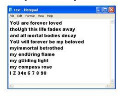
Fig.4. Text Image Sample And its output

You are forever loved though this life fades away and all mortal bodies decay You will forever be my beloved my immortal betrothed my enduring flame my guiding light my compass rose 1234567890