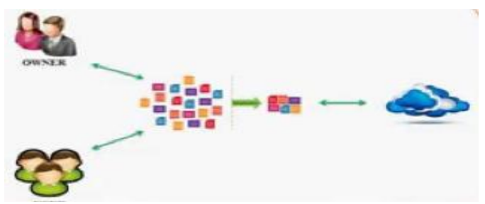
Figure 2: Proposed System Architecture

System Model: In this initial module, we tend to develop two entities: User and Secure-Cloud Service provider. User: The user is an individual or entity that needs to source data storage to the Secure-Cloud Storage providers and access the data later. In a very storage system supporting deduplication, the user only uploads distinctive data however does not upload any duplicate data to save lots of the upload bandwidth. moreover, the backup is needed by users in the system to provide higher reliability.