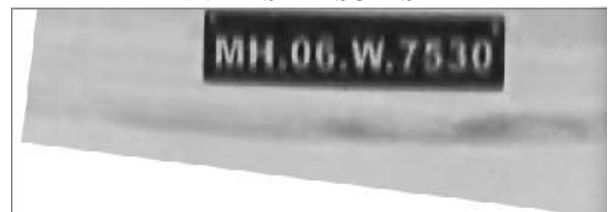
Fig.2. Blurred input image

The test images are the frames of a video taken at a toll booth. Since the camera is fixed, direction of vehicle's motion is towards the camera. Hence the vertical edges remain more or less intact, but there is considerable blurring of horizontal edges (like the horizontal line in 'H'). The objective of de-blurring therefore is to recover the blurred horizontal edges. The various kernels used are: