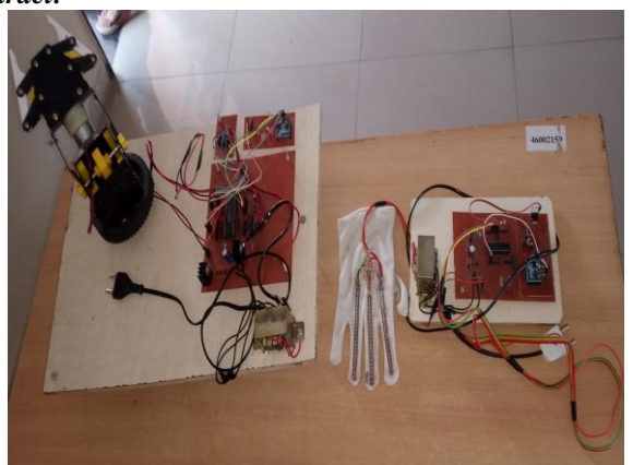
Sensor plays important role in robotics. Sensors are used to determine the current state of the system. Robotic applications demand sensors with high degrees of repeatability, precision, and reliability. Flex sensor is such a device, which accomplish the above task with great degree of accuracy. The pick and place operation of the robotics arm can be efficiently controlled using micro controller programming. This designed work is an educational based concept as robotic control is an exciting and high challenge research work in recent year. The project aims to design and implement a cost-effective and an affordable prototype model of robotic hand using haptic technology. The movements of the robotic palm are controlled by moving the user's fingers using the Flex sensors and Wireless ZigBee modules. The flex sensor system gives control signals to the arm wirelessly via ZigBee module and arm mimics the movement of the flex sensor system. DC motors were used to move the fingers of the hand. A robotic arm consists of several sections connected together by linkages that help the arm to travel specifically in a designed pattern, with sensors ensuring that all movements are exactly of the similar pattern. They are endowed with several degrees-offreedom, giving them the flexibility to move in many directions through multiple angles with utmost ease and agility.