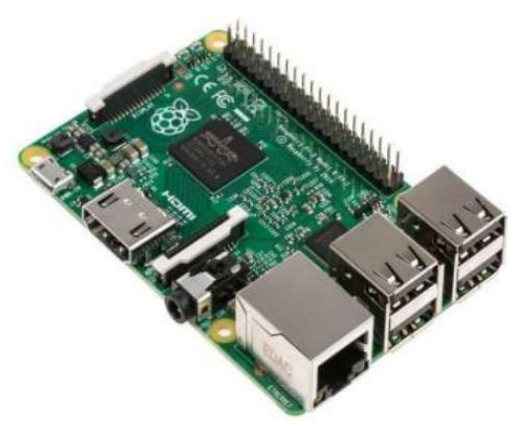
Figure 2: Shows the Raspberry Pi 2.