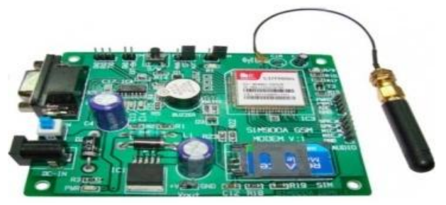
Fig 3: GPRS module

A GSM modem is a specialized type of modem which accepts a SIM card, and operates over a subscription to a mobile operator, just like a mobile phone. From the mobile operator perspective, a GSM modem looks just like a mobile phone. When a GSM modem is connected to a computer, this allows the computer to use the GSM modem to communicate over the mobile network. While these GSM modems are most frequently used to provide mobile internet connectivity, many of them can also be used for sending and receiving SMS and MMS messages [9]. Mobile services based on GSM technology were first launched in Finland in 1991. The SIM900A is a complete Dual-band GSM/GPRS module in a SMT type which is designed especially for Chinese market, allowing you to benefit from small dimensions and costeffective solutions. Featuring an industry-standard interface, the SIM900A delivers GSM/GPRS 900/1800MHz performance for voice, SMS, Data, and Fax in asmall form factor and with low power consumption. With a tiny configuration of 24mm x 24mm x 3 mm, SIM900A can fital most all the space requirements in your applications, especially for slim and compact demand of design.