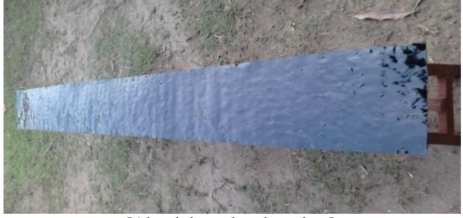
[Aluminium absorber plate]

The absorber plate is made of aluminum sheet having dimension 2m \times 0.3m \times 0.002m . The upper surface of absorber plate is painted with matt black layer to increase the absorptivity of the solar radiation and whereby reduces the temperature gradient between the inside and outside surfaces. 490 aluminum fins(dia. 4mm×100mm) are welded in 49 rows and 10 columns on the bottom of absorber plate. These fins are dipped into the PCM's bed for better conduction of heat from absorber plate to PCM's and vice-versa.