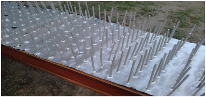
[Aluminium fins welded on bottom surface of absorber plate]