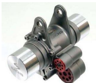
Fig. 5: Magnetorheological Damper