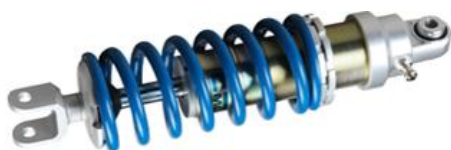
Fig. 2: Monotube Dampers