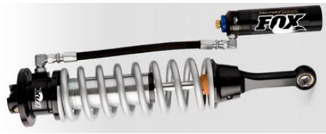
Fig. 4: Internal Bypass Damper