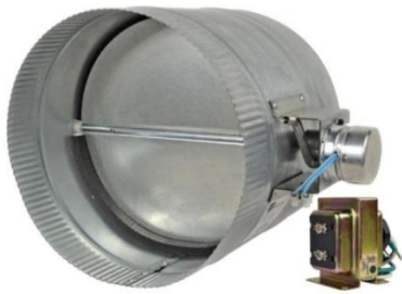
Fig. 7: Electronically Controlled Damper