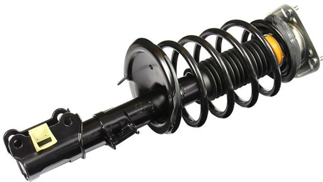
A SHOCK ABSORBER

A conventional automotive shock absorber dampens suspension movement to produce a controlled activity that keeps the tire immovably out and about. This is done by converting the kinetic energy into heat energy, which is then consumed by the shock's oil. The Power-Generating Shock Absorber (PGSA) converts this kinetic energy into electricity rather than warmth using a Linear Motion Electromagnetic System (LMES). The LMES utilizes a thick lasting magnet stack installed in the fundamental piston, a switchable arrangement of stator coil windings, a rectifier, and an electronic control framework to deal with the shifting electrical output and damping load. The base shaft of the PGSA mounts to the moving suspension part and powers the magnet stack to respond inside the annular exhibit of stator windings, delivering rotating current power. That power is then changed over into direct current through a full-wave rectifier what's more, put away in the vehicle's batteries. The power produced by each PGSA would then be able to be joined with power from other power age frameworks (for example regenerative braking) and put away in the vehicle's batteries.