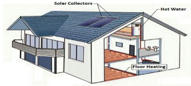
Fig 4. Scheme of a common grid connected roof integrated PV installation

.The inverter is used to convert the DC to AC .The AC output from the solar installation is wired back to the main consumer unit The consumer unit is connected to the electricity grid via an export meter. Such an installation is termed “grid-tied” because the electricity supply for the building is met by a combination of solar energy and grid electricity [1] [4].