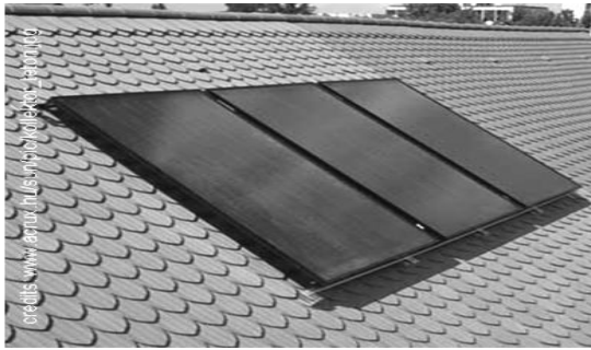
Fig 1. Glazed flat plate collector