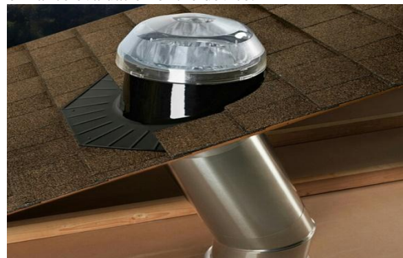
Fig 5. Solar optical system on the roof

Recently, energy and environmental concerns have made day lighting a rediscovered aspect of building lighting design. Day lighting is often integrated into a building as an architectural statement and for energy savings. The idea of piping light from a remote source to an interior space for illumination purpose appeared about 120 years ago light pipe is now being adopted and applied world widely for both artificial and natural day lighting purposes. With the increasing use of solar light pipes, more attention is being paid to their development, especially to the day lighting performance evaluation of the device.