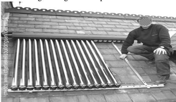
Fig 3. Vacuum tubes collector