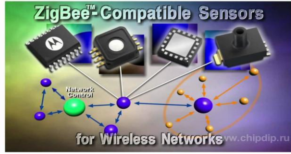
Fig.2. ZigBee sensor

collision. Maximum number of devices supported is 232 . ZIG BEE