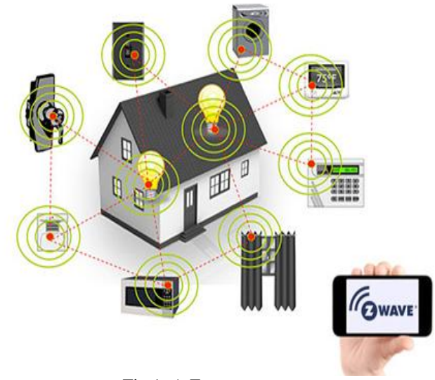
Fig.1. A Z- wave system

The Z-Wave technology was developed by a company named Zensys. Z-wave consists of four layers and and RF media that is controlled by the MAC layer. 1. Application layer - Controls the decoding and execution of commands within a Z-Wave network 2. Routing Layer - Controls the routing of packets within a Z-Wave network 3. Transfer Layer - Controls the transfer of data between devices - this includes retransmission, acknowledgements and checksum check 4. Mac Layer - Controls the usage of the radio frequency medium.