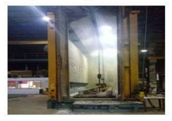
Fig 2.6: Zinc bath cattle in galvanization