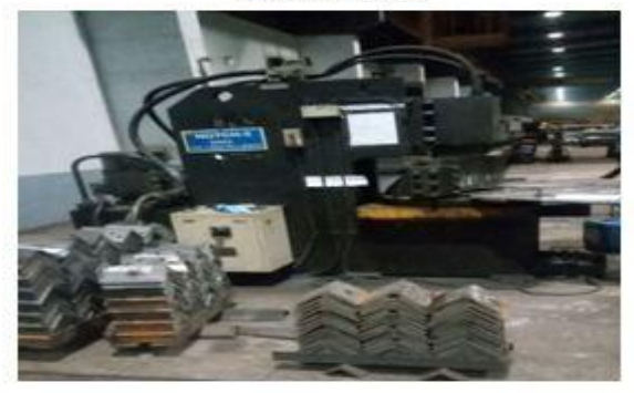
Fig2.5: Notching machine