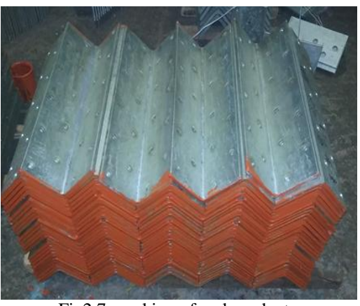
Fig2.7: packing of end products