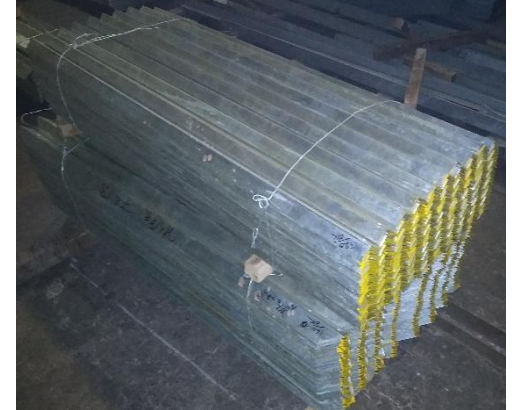
In this step we have added working hours and number of shifts.