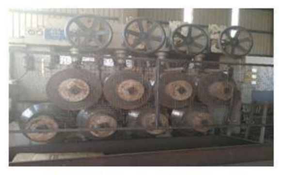
Fig2.3: Straightening machine