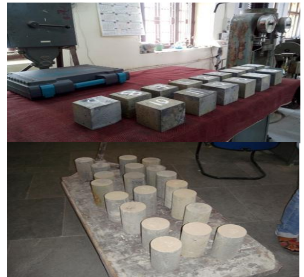
(a) Concrete cube samples, (b) Concrete cylindrical Sample

The example is set up for compressive quality, malleable break quality and flexural quality test. Fifteen examples are considered for every piece proportion of each test class. The solid blend is done utilizing a research center revolving blender. The process ability of the solid blend is estimated utilizing the settlement cone test as indicated by IS: 1199-1959. For the assurance of the compressive quality, the size mm 100 x 100 x 100 mm (Figure 3.1a), the segment with estimate 100 x 200 mm (Figure 3.1b), the barrel with measure 100 x 100 x 500 mm (Figure 3.1c), the elasticity and the rigidity was estimated. All examples are cured for up to 28 days in ordinary running water under normal climatic conditions.