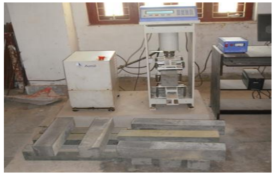
(c) Concrete prism Fig 3.1: Typical specimens prepared in the present study