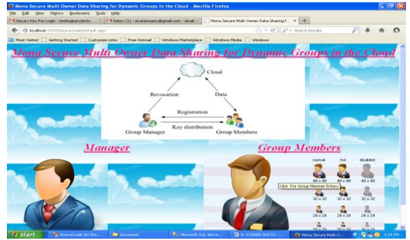
Fig: Home Page