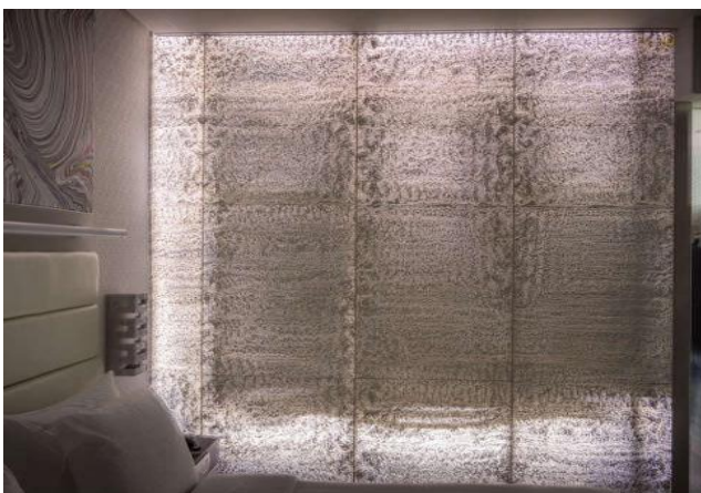
Figure 7.1 and 7.2; Aesthetic attractive interior view provided by using translucent concrete panels.