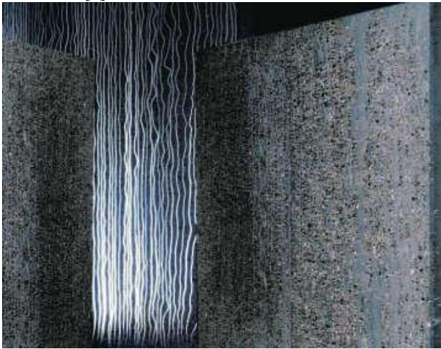
Figure3.1 Fibers embedded within concrete

Translucent concrete work is based on principle of “Nano-Optics” [5]. Optical fibers pass same amount of light when tiny slits are placed directly on top of one another as when they are scattered or irregular in their positions. Hence optical fibers within the concrete act as narrow tubes and carry the light across and within concrete. Transparent concrete basically works on total internal reflection. When a light ray travel from a denser medium to a rarer medium so that the angle of incidence is greater than critical angle, the ray reflects back to the same medium, and in optical fiber this total internal refraction repeats numerous times till it comes out from the other end of fiber [6].