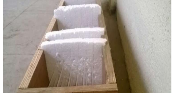
Figure 4.1 Formwork or mould used for laying translucent concrete with fibers already being placed.

obtained after cutting the edges of fiber is quit rough thus for smoothing of surface proper finishing is must. The optical fibers lead light rays between the two sides of the concrete blocks. The parallel position allows the light reflection on the bright side of wall appears unchanged at most of times on the darker side. An important form of this phenomenon is probably the sharp and clear display of shadow on opposite side of the wall. Thin layers allow an increase in amount of light passing through the concrete [12].