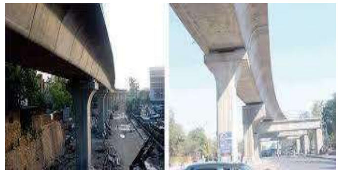
(a) Typical Elevated Metro Bridge (b) Typical Pier Figure 1: Typical Elevated Metro Bridge and its Elements

An elevated metro system has many component, but two major components pier and box girder. A typical elevated metro bridge model is shown in Figure. Viaduct or box girder of a metro bridge requires pier to support for each span of the bridge and station structures. Piers are constructed in various cross sectional shapes like cylindrical, elliptical, square, rectangular and other forms. A typical pier considered for the present study. Box girders and segmental box girder are used extensively in the construction of an elevated metro rail bridge. This metro rail systems, is used in horizontally curved in plan box girder bridges. That is quite suitable in resisting torsional and warping effects induced by curvatures. The torsional and warping rigidity of box girder is due to the closed section of box girder. The box section also possesses high bending stiffness and there is an efficient use of the complete cross section. Box girder cross sections like single cell, multi cell as shown in Figure below 1.2.