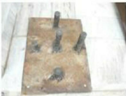
Figure 2: Punch for piercing hole