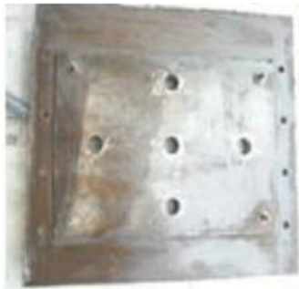
Figure 1: Base plate