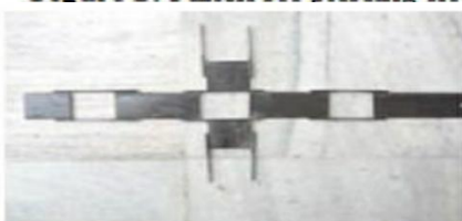
Figure 3: Clamping Plate for punch