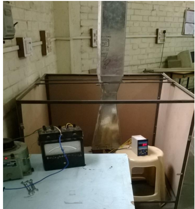
Fig. 3. Fin array assembly is mounted inside the cavity of syporex block and chimney for forced convection