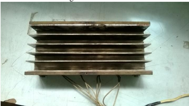
Fig.1. Assembly of the fin array