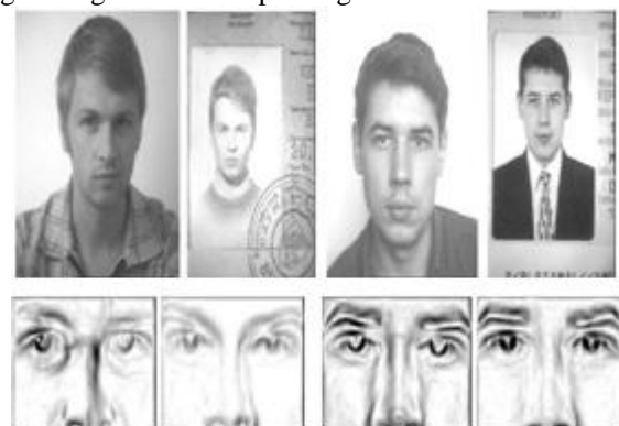
Fig. 2. Original (upper row) and normalized images (lower row), respectively.

We can rely on the fact that face expression in document photos is usually minimal, at least discreet, while for a camera control image the test person can be requested to restrain from excessive expressions. Additional features from the original image can be gleaned in the form of a gray-scale edge map using Deriche algorithm. Examples of the input images are given in the top of Fig.2.