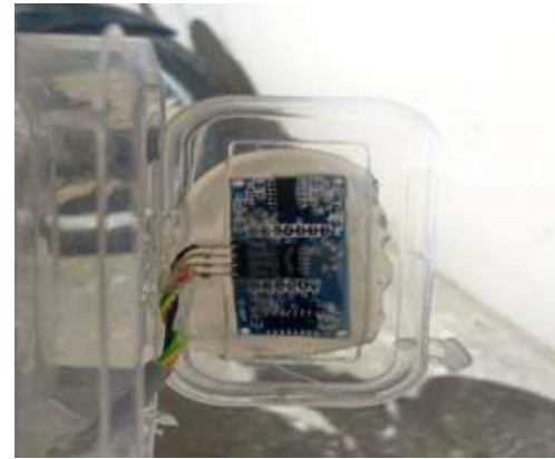
Fig-1. Ultrasonic Emitter and Receiver Mounted on Motor Bike